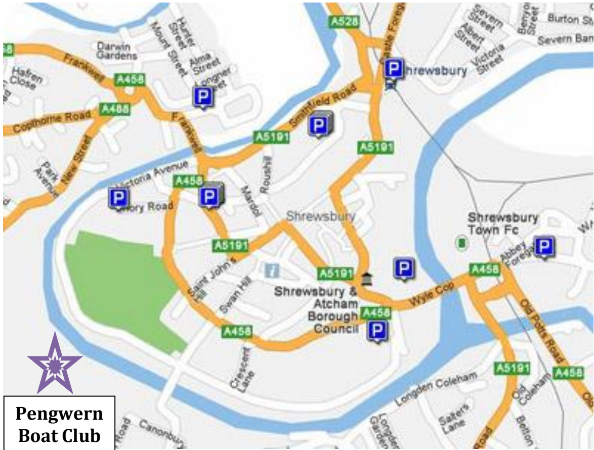
Pengwern Boat Club